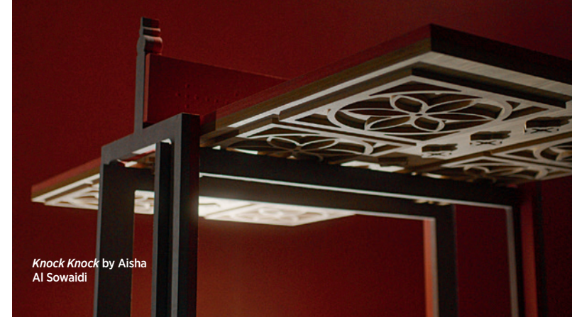
Knock Knock by Aisha Al Sowaidi