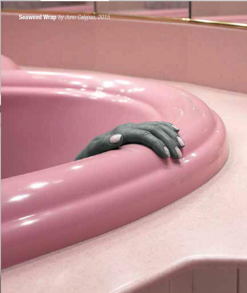
Seaweed Wrap by Juno Calypso, 2015

erated as they are currently experiencing the ferent colors and expression methods. Depending o different tones, and depending on the material y color with a completely different image from the als are over-hued and over-toned to the extent in the past. Importantly, it is a key to strategically ed image of color or material.