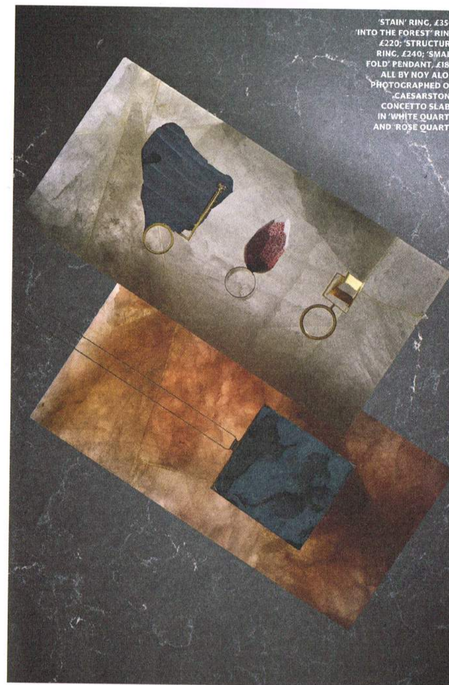
'STAIN' RING, £350; 'INTO THE FOREST' RING, £220; 'STRUCTURE' RING, £240; 'SMALL FOLD' PENDANT, £180. ALL BY NOY ALON. PHOTOGRAPHED ON 'CAESARSTONE CONCETTO SLABS IN 'WHITE QUARTZ' AND 'ROSE QUARTZ'

Designed by Andrey and Shay, these form part of a collection that includes a large table mirror and a wall mirror.